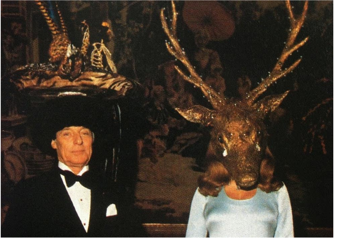
Images courtesy of Legendary Parties by Prince Jean-Louis De Faucigny-Lucinge.